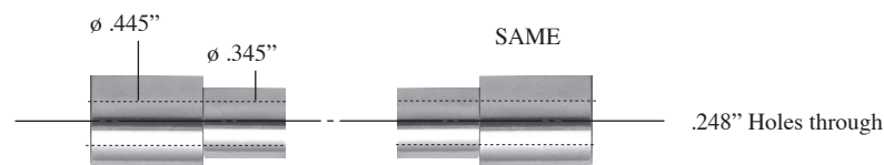
Diagram C / Bushings #PKCHPENBU