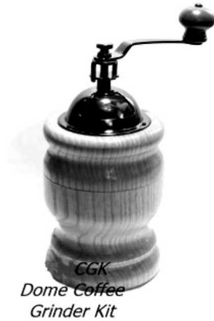
CGK Dome Coffee Grinder Kit

If you are a coffee lover you will know that a quality grind means a great cup of coffee.